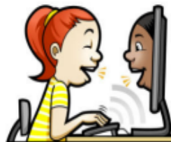
A Parent's Guide to Social Media