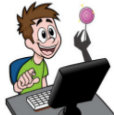
A Parent's Guide to Online Grooming